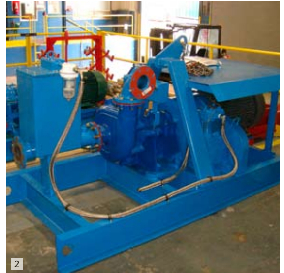
1: MF160 trailer mounted unit with mechanical prime 2: Electric motor driven with WARMAN® XU slurry pump with mechanical prime 3: Custom trailer with Vactronic® Prime