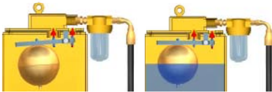
Empty tank with vacuum line open

When the unit is started, the priming system will quickly and efficiently lift water up to the priming tank to prime the pump. The level of the water in the priming tank is controlled by a "ball float" system which cycles as needed to ensure the system remains primed at all times.