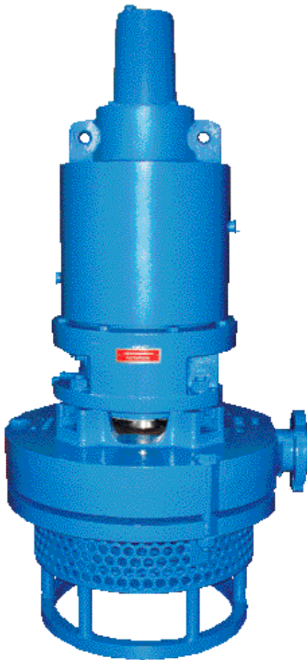
3. The SHW Heavy Dut Submersible pump is available in sizes up to 450mm and 500 hp