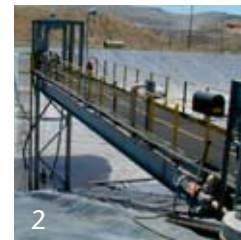
1. Events pond at roaster plant 2. Events pond

The competitor's pumps lasted two months; the Warman SHW submersible has been keeping it clean for a year.