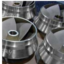
From below left to right: Stainless steel impellers Bowl assemblies Floway pumps state of the art testing facility

Floway is certified to ISO 9001 and 14001, and OHSAS 18001 management systems.