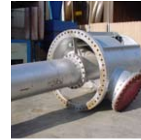
From left to right: Typical API discharge head Floway Pumps are manufactured to the highest quality to ensure long service life