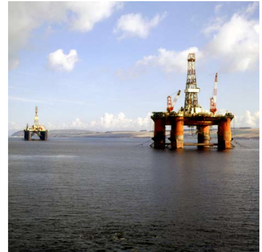
Floway pumps are used in a variety of oil and gas applications both upstream and downstream including pipeline, offshore platforms and refinery