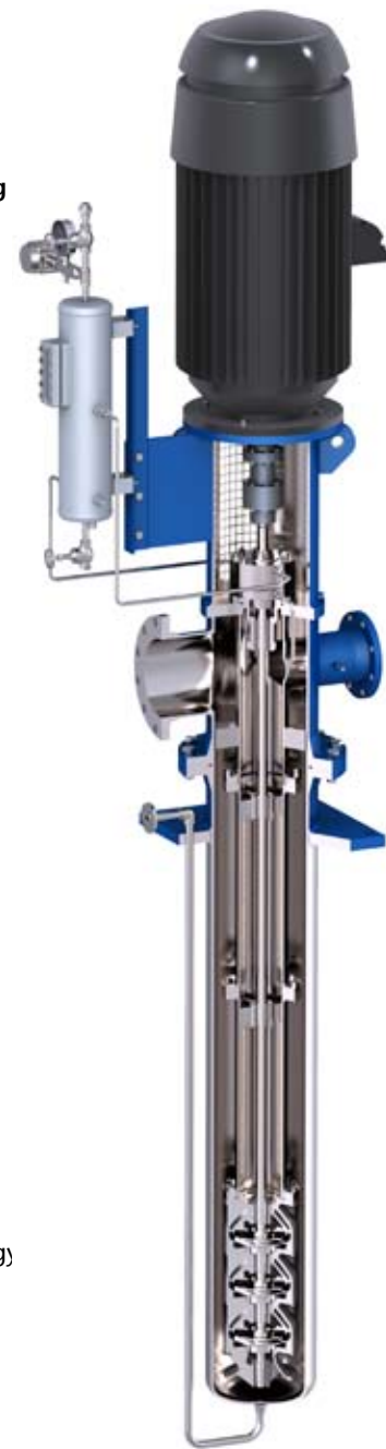
VHP VS1 Single Casing